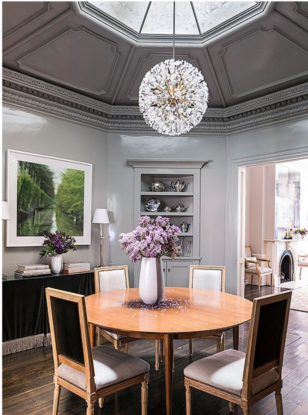
The formal dining room, with its beautiful 12-foot-high octagonal ceiling, is also the home's grand entry. "We can fit 10 to 12 people in here," says Nina of the leaf table. The high-gloss walls are painted with Farrow & Ball's Lamp Room Gray. The Lynn Geesaman photo was Nina and her husband's first art purchase together.