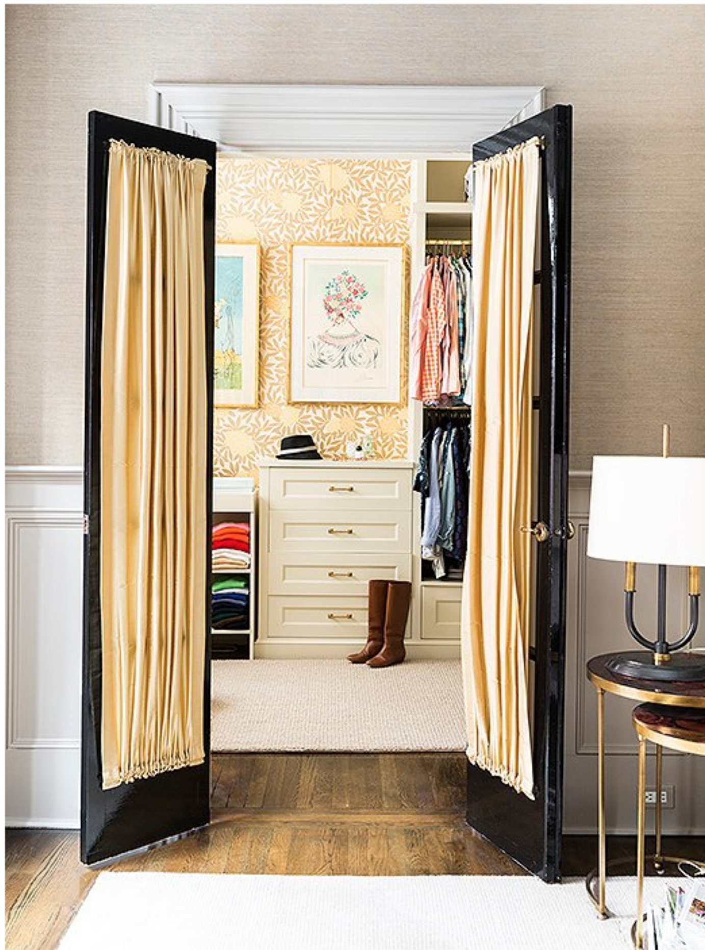
Plaster moldings and doors painted in a Fine Paints of Europe high-gloss black frame the entrance to the spacious walk-in closet, which was once a nursery for Nina's daughter.