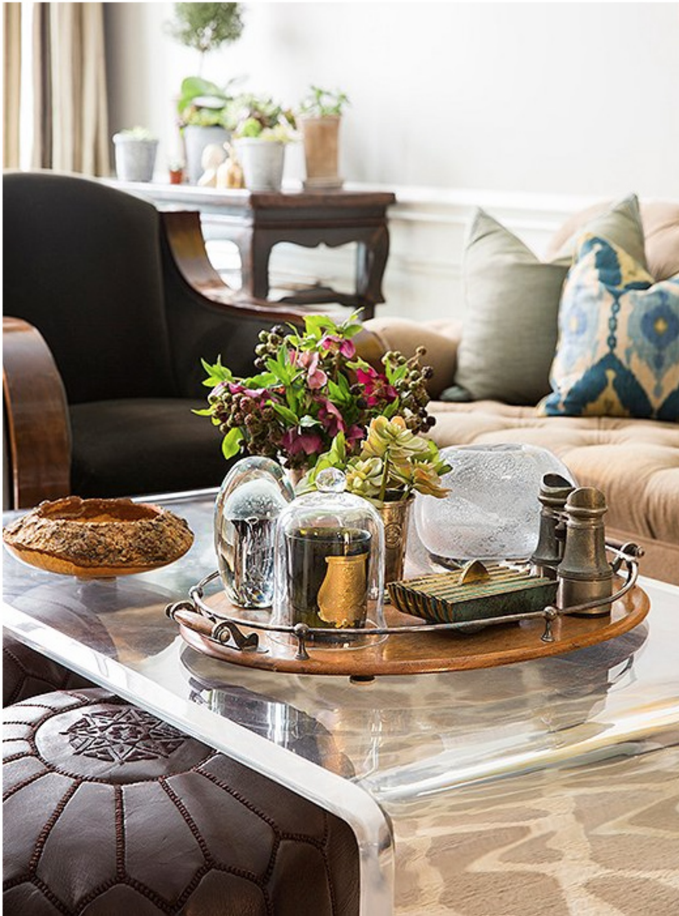
A sturdy Plexicraft waterfall coffee table is topped with favorite objects, from a Cire Trudon candle ("My favorite scent is Pondichery. It reminds me of an Indian spice market") to sculptural glass vases.